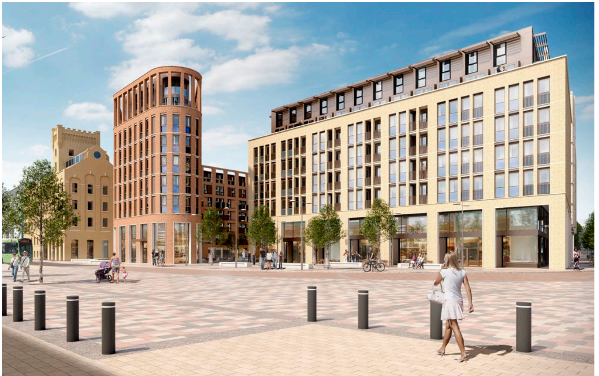
Artistic impression of 3 & 4 Station Square. For illustrative purposes only.